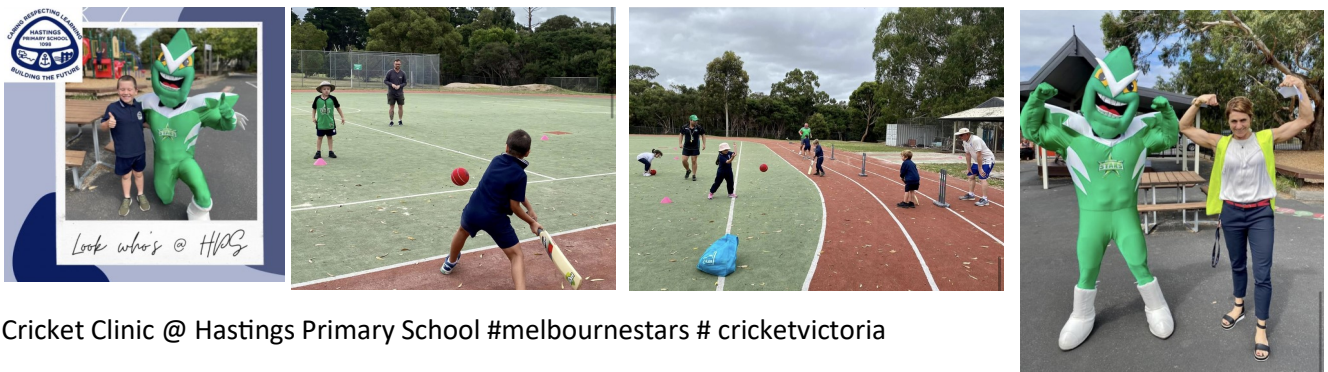
Cricket Clinic @ Hastings Primary School #melbournestars #cricketvictoria

We are so proud of how quickly our families have stepped up to support the Naked Lunch Box Initiative at HPS. We have less litter and we are seeing more colour in our lunches already.