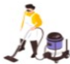
Authorised work or education with permit