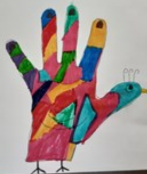
Zoey Baker 1/2B