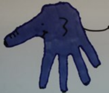
Stella Doll 1/2D