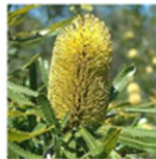
Yellow House: Wallum