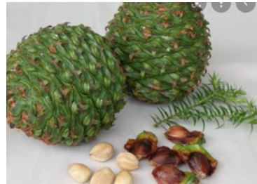
Green House: Bunya