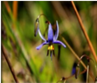
Blue House: Murrumbal