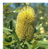
Yellow House: Wallum