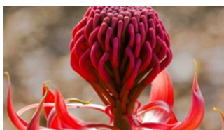
Red House: Warada