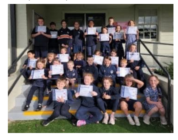
Friday 13th May