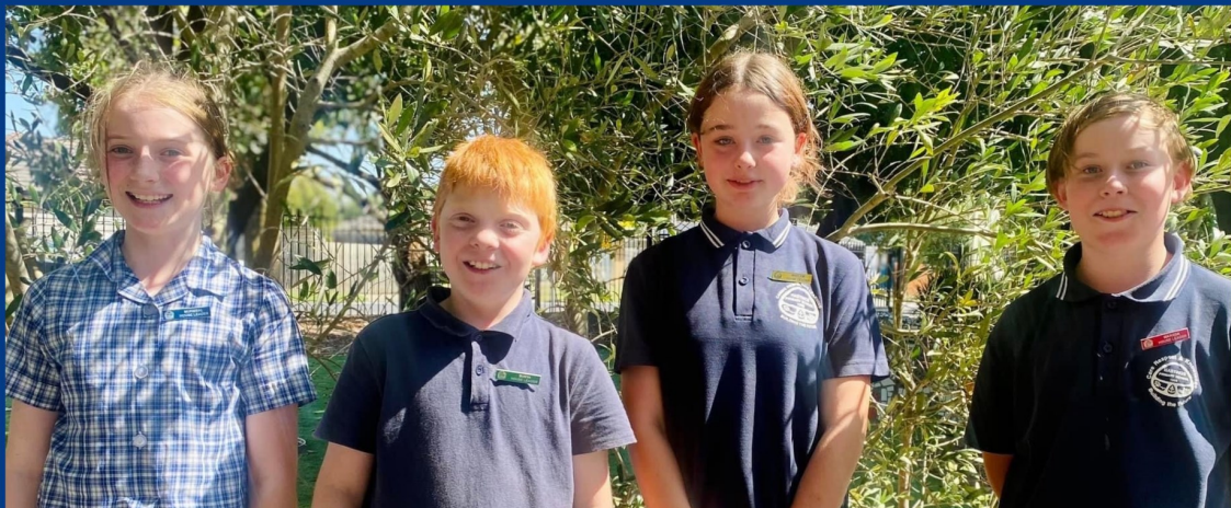
STUDENT REPRESENTATIVE COUNCIL