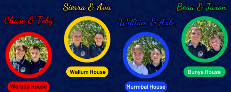
Chase & Toby